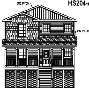
HS204-A Front Elevation SOME FEATURES MAY BE OPTIONAL OR ADDED ON SITE