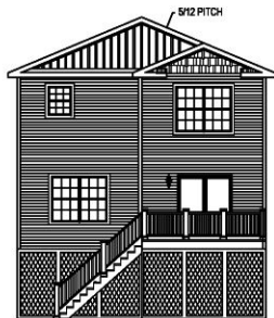
HS204-A Back Elevation SOME FEATURES MAY BE OPTIONAL OR ADDED ON SITE